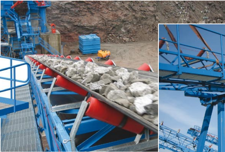
Heavy Duty design for hard-rock applications.