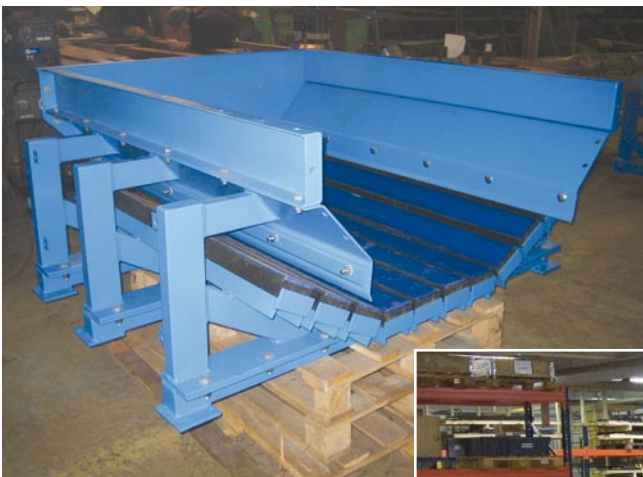
Heavy duty loading point ready assembled. Easy replacement of wear parts.

Sandvik is a leading supplier of components for belt conveyors used in the handling of bulk materials. Wide selection of Sandvik conveyor components is available for fast delivery from stock..