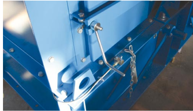
Easy maintenance and servicing. All required maintenance points at head end collected on the same side; inspection hatch, lubrication piping, belt cleaner adjusting and scraper blade change.