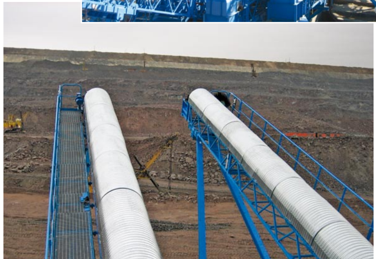
Environmental protection has been considered, conveyor covers and dust enclosures available to cover the whole conveyor.