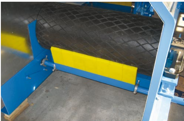
Belt cleaning device with replaceable multiple scraper blades, easy to maintain from one side only.