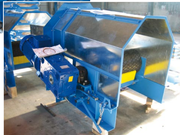
Assemblies completed at work shop ensure trouble free start-up and good belt tracking.