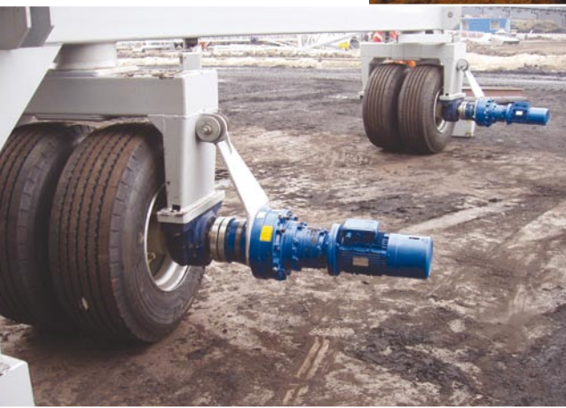
Mobile units on rubber tyres are also available. Self-driven or movable types.